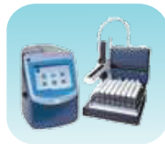
Total Organic Carbon 3800